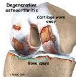
Adapted from eorthopod.com on 1st August 2009

The bones grow outwards and develop osteophytes or bony spurs. The synovium swells slightly and can cause the joint to swell. The capsule slowly thickens and ligaments contract, the muscles may become weak or wasted.